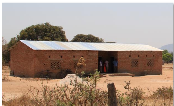
Community school building

Classes initially met in a thatched shed, but as the school added primary classes, the community began erecting a dedicated school building. As is typical, community members provided the standard construction material (i.e., sand, bricks and similar), while the MESVTEE provided iron sheets for roofing. The school also had a grant for materials from the District Council. Construction finished in late 2009, although the walls were yet to be plastered.