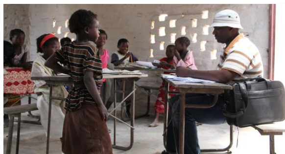
Data collection activities

The cases of Mtsinje and Nkhujje Community Schools offer some insights in this regard. Although their PCSCs' formal activities overlap in significant ways, there are some telling differences, particularly in community members' accounts of PCSC effectiveness. Mtsinje Community School's PCSC seemed more effective at involving local traditional leaders in the school, and was practically dogmatic in managing learner attendance. Combined with monitoring of teacher attendance, this may lead to greater time on task at Mtsinje. Many parents took great interest in school management (if not so much in its infrastructure). This was demonstrated by consistently high parent turnout at each visit by the research team and by the many parents who asked to speak with the researchers at their own behest (i.e., without invitation from the researchers). In contrast, community members from Nkhunje Community School were observed in the school only on a single occasion, when the researchers invited them for a focus group discussion. In the absence of other observable differences between the two schools, these differences in PCSC roles are the most plausible explanation for Mtsinje Community School's better performance in 2012.