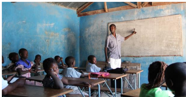
Sample school site visit

The conflict around school staffing prompted the MESVTEE zonal head to make a special visit to the school to mediate a solution. In addition to resolving tensions for the time being, this visit indicated that the MESVTEE is actively supporting the school community when it needs an objective arbiter. Additionally, the zonal head has taken an active role in monitoring the school, has attended at least one committee meeting, and has conducted a number of site visits.